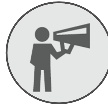
up to 2-year experience candidate